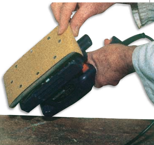
Standard perforated abrasive sheets are attached to the VX150 orbital sander using the basic clip system

The sliding on-off switch at the front of the body is conveniently positioned for operating with the forefinger, but is a little on the stiff side.