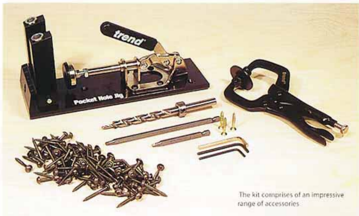
The kit comprises of an impressive range of accessories.

Regular screw fixing methods also may not be a satisfactory option for certain practicality or cosmetic reasons. This is where the method of pocket hole screw fixing is a good jointing solution. It is a particularly quick and convenient method, especially when undertaken with the new Trend Pocket Hole Jig.