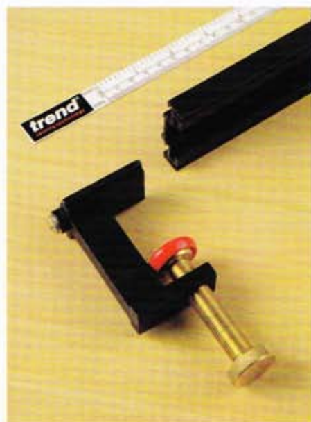
Detail showing the adjustable friction clamps and tape measure

From all good tool stockists Tel 01923 224657 Web www.trend-uk.com