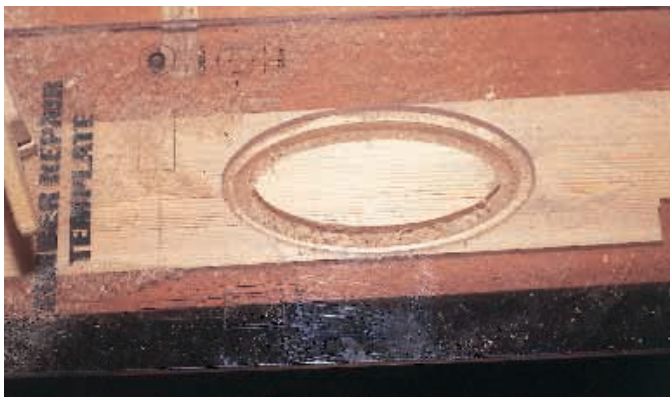
The 'patch' completed, wood secured to waste using double-sided tape

template onto the material over the knot or defect, fitting the cutter and the guide bush along with the collar to the router. You then plunge down and remove the waste by moving the router in a clockwise direction which will produce an elliptical recess with a flat bottom.