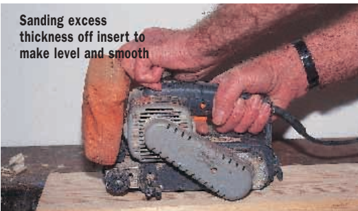
Sanding excess thickness off insert to make level and smooth

This is another clever idea from Trend, it achieves exactly what it sets out to do quickly and effectively, with the repair being almost invisible on completion. It will have a place on antique repair work, especially for burn damage on table tops. It also opens up possibilities for decorative inlay work using woods of contrasting colours.