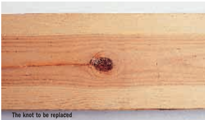
The knot to be replaced

Trust Trend to come up with a solution. The kit consists of a plastic template, a 10mm cutter, a 20mm guide bush and a 40mm collar. First stage is to rout out the defect, this is carried out to a depth of around 5mm. This stage is achieved by cramping the