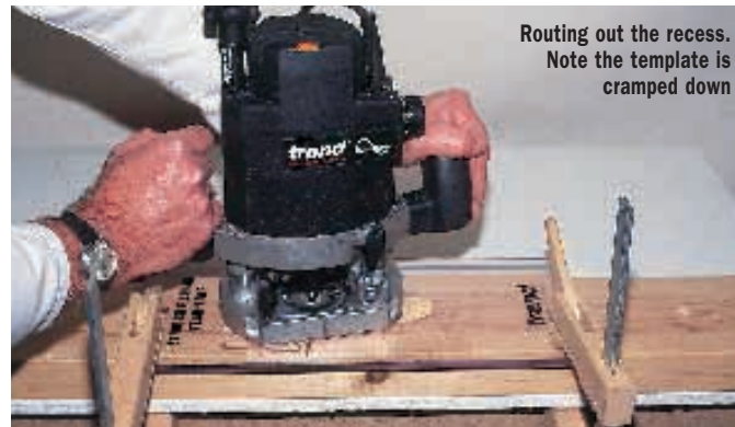
Routing out the recess. Note the template is cramped down