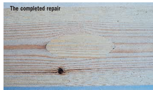
The completed repair