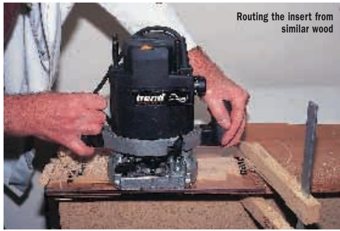
Routing the insert from similar wood

I found this kit to achieve a perfect repair the first time of using, although care is needed