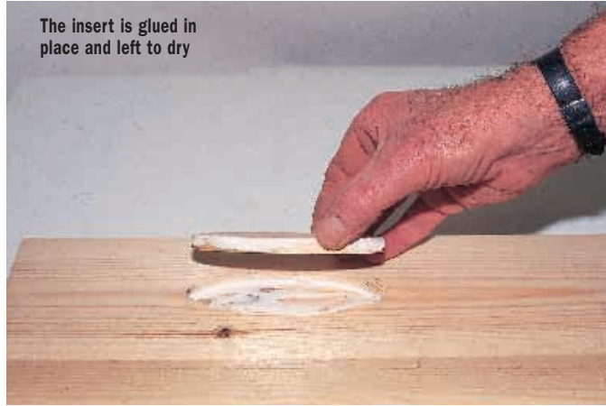
The insert is glued in place and left to dry

to ensure there is exact concentricity between the cutter and the guide bush, or the fit of the inlay piece is likely to be too slack or too tight. The guide bush supplied will fit a wide range of popular routers, but for some makes the Trend Unibase might be required. The actual size of the repair is 120 x 45mm.