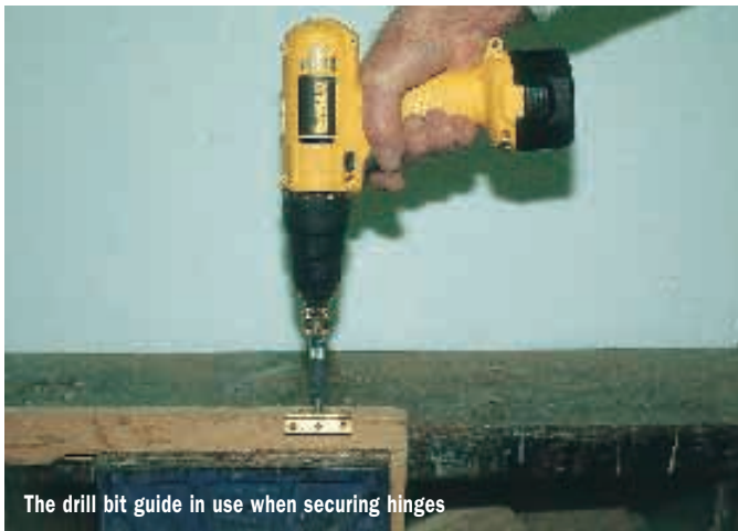
The drill bit guide in use when securing hinges