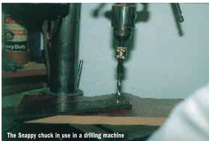
The Snappy chuck in use in a drilling machine

adjustable countersinks on their shanks, and two which Trend call drill bit guides. These are designed for drilling pilot holes for screws through the countersunk holes of hinges and other hardware. A spring loaded sleeve with chamfered end sits in the countersinking, then the bit within drills the hole with exact concentricity. Two sizes are included. A wide selection of screwdriver bits, hexagonal headed drivers, and square drive adapters are included, along with a tapered drill. This will drill, or enlarge, holes in