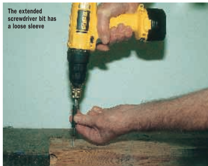
The extended screwdriver bit has a loose sleeve

The good quality of all the products are typical of everything which Trend offer, and the range of applications is very wide. I tried most of the contents of the larger set, and while the real assessment of any product only comes after extended use, I was very satisfied with my trials. A big advantage of buying a set is the canvas case in which they are contained, not only does this offer protection, it holds all the contents in an organised way with each one having its own place. Good value for money for what is included.