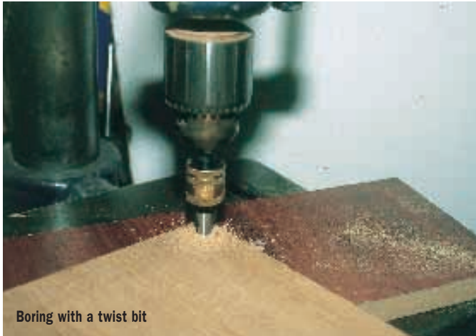
Boring with a twist bit