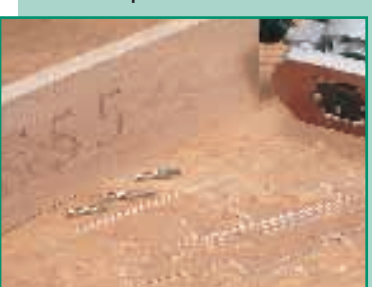
Both numeral and alphabet templates can be used with alternative cutters to produce rounded, moulded or Vee cut lines, all using the same diameter (13mm) guide bush.

With a nominal letter height of 57mm, these templates are intended for producing name boards and directional signs for both commercial and domestic applications. Available as a set of three letter templates or two numeral templates, they are intended for use with a 13mm guide bush and straight flute 8mm cutter (available together as an optional extra: Set Temp/LN57x1/4 @. £9.95 ex vat ).