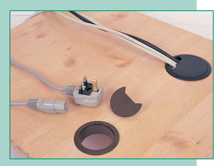
Trend also supply a range of plastic cable tidys and inserts in several different colours

Standard size cable tidy inserts, in brown, grey or black, are available from various manufacturers or (at £4.95, £5.95 or £6.95 per pack of 3) from Trend.