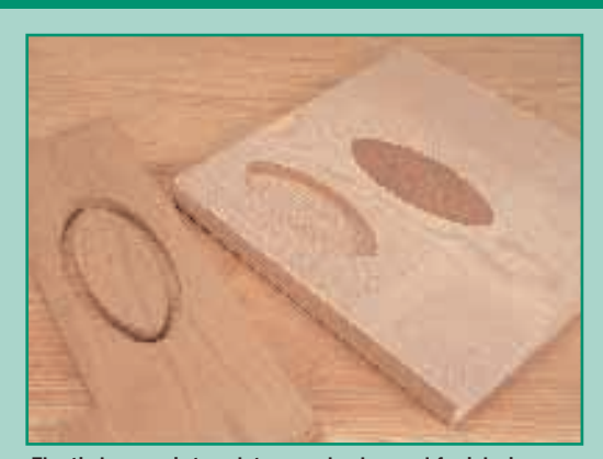
The timber repair template can also be used for inlaying contrasting timbers, veneers or laminates

This oval template is designed for cutting both the recess and plug for covering knots and surface blemishes. To achieve this it is supplied complete with a 10mm long shank cutter, 20mm guide bush and a guide bush collar to increase the guide bush diameter to 40mm. The guide bush is of the Trend T5 type. The template measures 400 x 180mm with parallel edges. For surface repair operations, the template is simply held in place with double-sided tape or cramps over the knot or blemish, with the major axis along the grain.