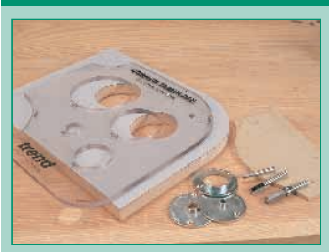
The corner and hole template can be used not only for rounding corners and cutting infinite diameter holes, but for producing accurate, square edged curved templates

This template is intended for cutting concave and convex curves as well as holes, making it ideal as a master template for producing precision curved and compound curved working templates. It can also be used for rounding corners on panels, table tops and worktops, as well as for cutting holes for finger pulls, inserts, ironmongery and other decorative features.